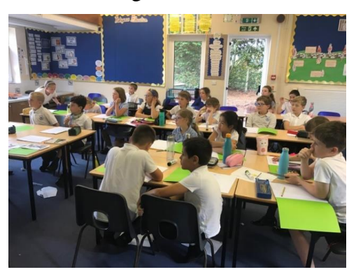
Class 3 focussing hard on new science knowledge

Welcome to our new children in Foundation. They have all settled in really well this week. All the children in all the classes seem to be enjoying getting back into work. It is lovely to see all our families again.