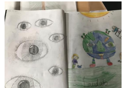
Eyes of the World art work