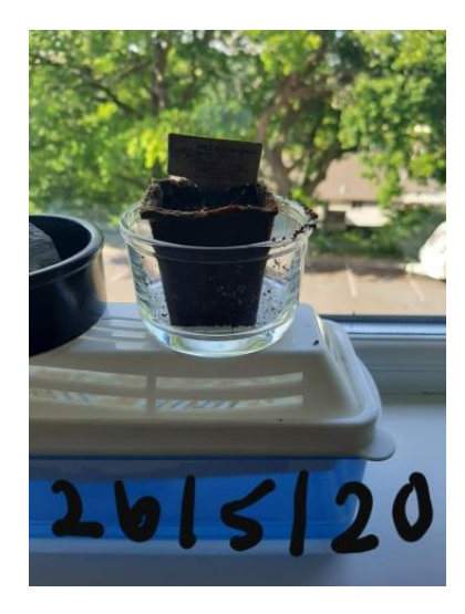
Rhys Class 3 growing seeds