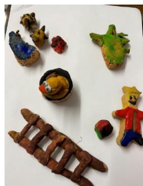
Austin's "Little Duck" salt-dough creations